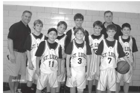
The CYO Boys Jr. Varsity A Basketball Team & coaches

Discount Registration Fees - Spring sports registration will be announced shortly. A significant discount on the registration fee will be applied to all those who regularly participate in the Food Certificate Program (those who purchased at least $50 a month worth of food certificates in the past 3 months). Fees for baseball and softball will be $40 for FCP participants and $80 for non-participants. The fee for track will be $10 for FCP participants and $40 for non-participants.