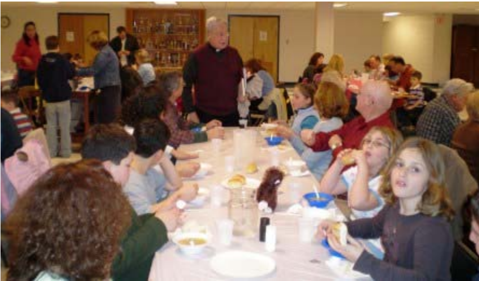
The PREP-sponsored Lenten Sacrifice Supper was well attended with over 160 participants. The supper was followed by the Stations of the Cross.