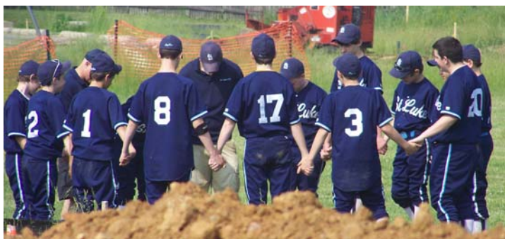
Our CYO Big Blue baseball team praying together before their game last week.

A CYO Membership is required to participate in any CYO sponsored sport or activity.