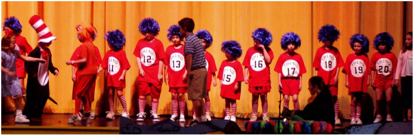
Above: Junior show 'Things' take over the stage at the Keswick Theatre.