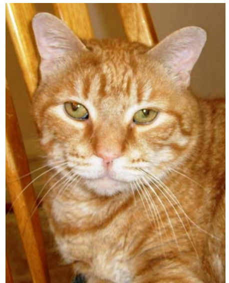
Columcille, Rectory Cat

Last week's bulletin was very popular. There were no copies left by Monday morning! We think the photographs were the greatest interest. So we have decided to reprint the photo of Columcille.