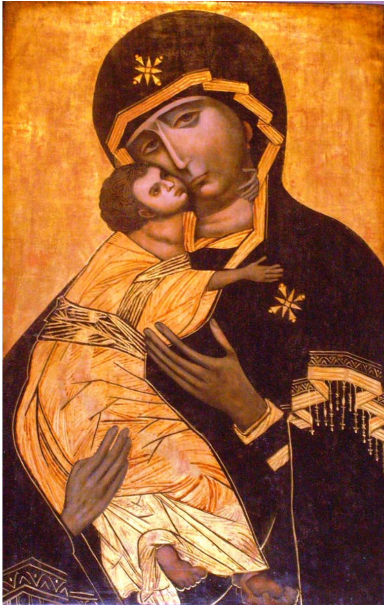
Our Lady of Vladimir or Our Mother of Tenderness