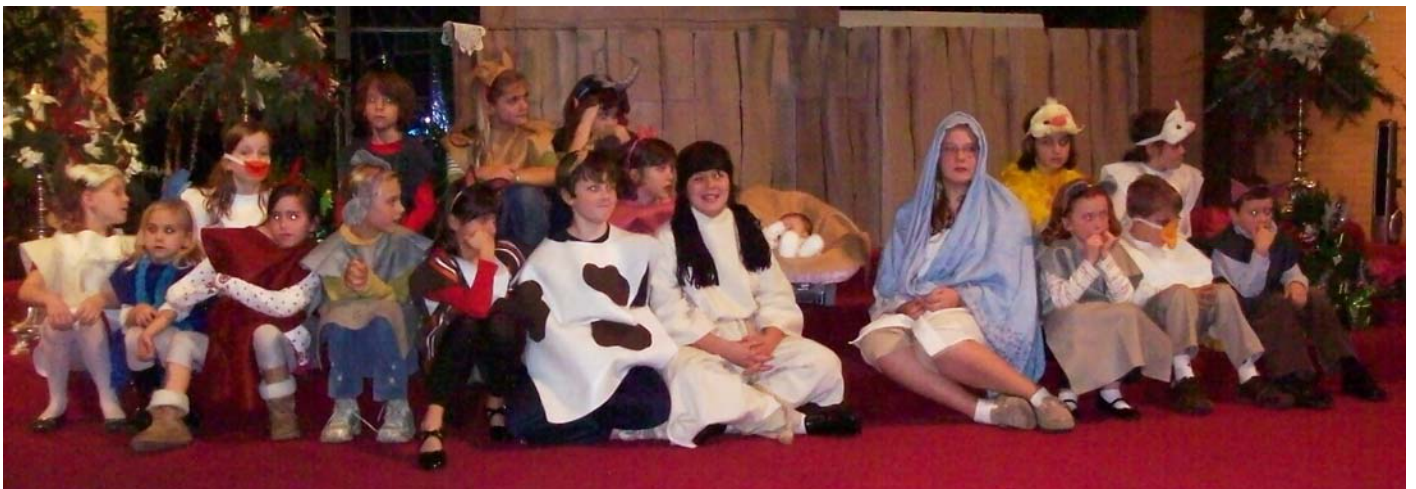
PREP students representing visitors, including many animals, to Baby Jesus at Dec 15 event.

The Altar Servers will sit in reserved pews. There is also a limited amount of space in the Cathedral for parents and other family members.