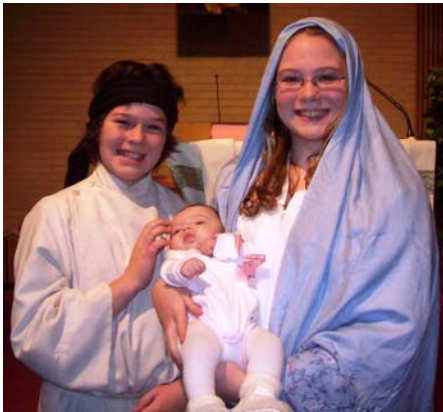
PREP students portrayed Mary and Joseph. Future PREP student portrayed Jesus.