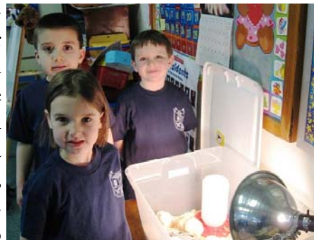
Kindergarteners proudly display their chicks.

The class was responsible (with supervision) for regulating the temperature and humidity, and turning the eggs a few times per day. Quiver Farms states that the project is designed to teach life lessons about "farm life and about the animals that make our life possible." The class was able to hatch chicks from all 12 eggs, who were collected by Quiver Farms and made the journey back to the farm. For more info visit www.quiverfarm.com