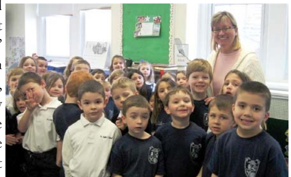
Students waiting to taste the donuts!