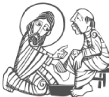
image of what the Church is supposed to look like, feel like, act like.

Thursday evening we enter into this Triduum together. After listening to the scriptures, we witness the washing of the feet. The priest-celebrant goes down on his knees with a pitcher of water, a basin, and towels. Jesus gave us this