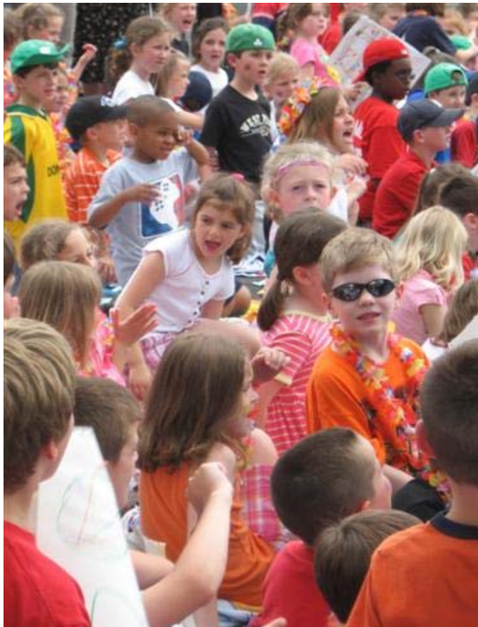
The entire student body cheers on their favorite teams at the Faculty/Student volleyball game during Summer Blast.