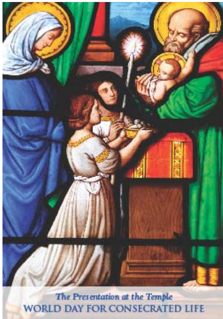
The Presentation at the Temple WORLD DAY FOR CONSECRATED LIFE