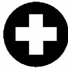
Red Cross Blood Drive

The American Red Cross has scheduled a blood drive here on August 18 (because the Hall is air-conditioned) from 1:30 pm to 7:00 pm.