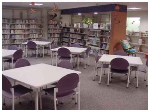
Newly renovated Media Center