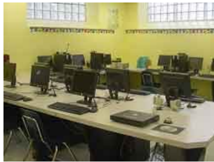
State-of-the-art Technology Lab