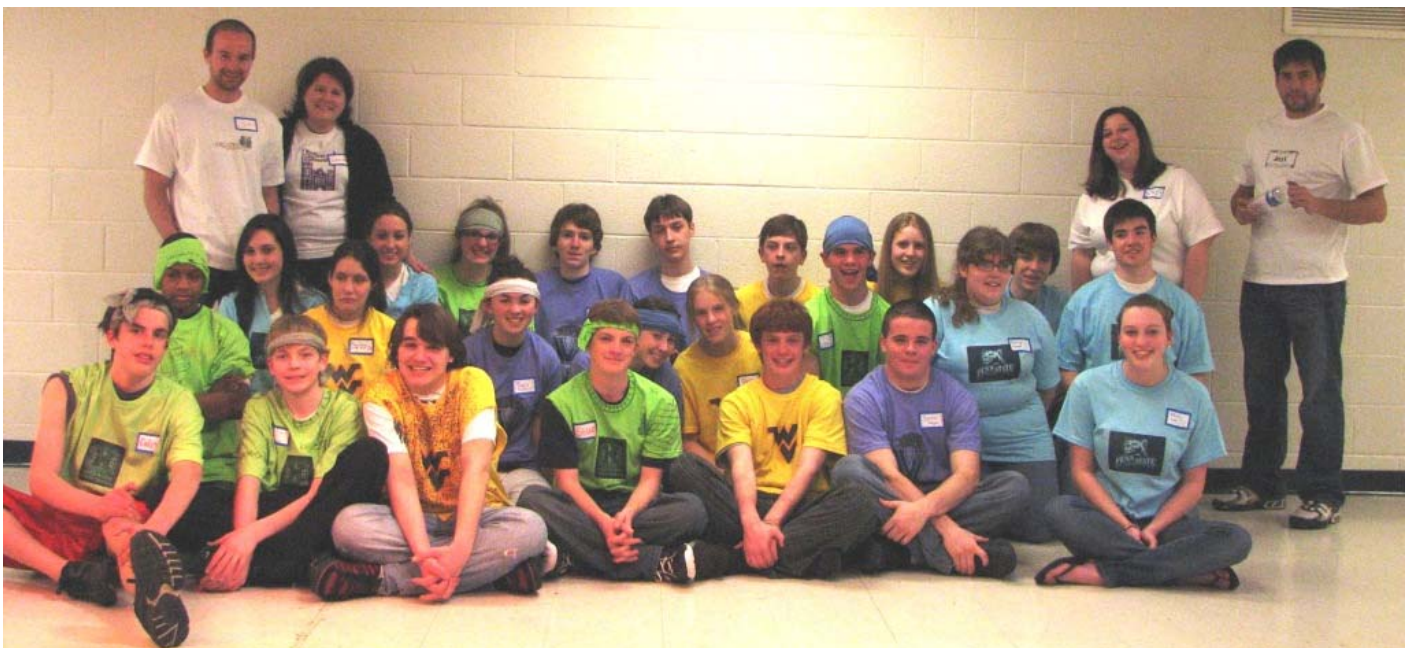
Members of the Youth Group at last weekend's Lock-In.

Session Description: For many students, choosing a college is an overwhelming experience. Nevertheless, many go about this decision haphazardly. We'll help break down the complexities of this process. In this interactive session, you will think about what is important to you, and how to find a college that will meet your expectations and support your success